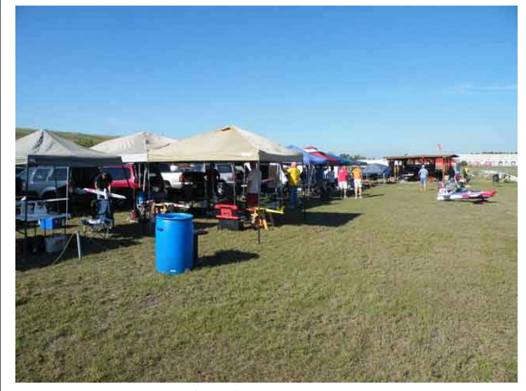
The East side of the flight line – wall-to-wall tents

Thanks to all the members for the tireless work to put on an excellent event and for volunteering your time so we can all play. I have received thank you letters from all over the country from the guys who were here and they all loved the event. We had pilots from Minnesota, Georgia, North & South Carolina, Venezuela, Texas and of course Florida. Thanks again to all the volunteers who made all of this possible.