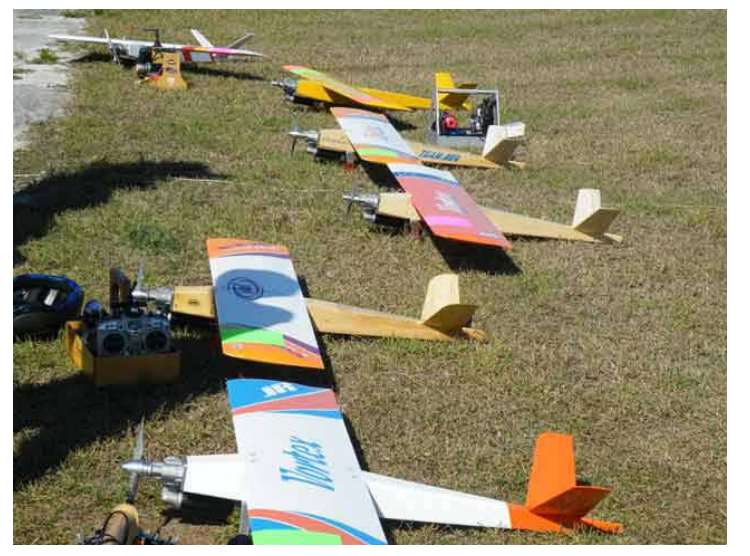
A few Quickies in the staging area ready for battle

OUR NEXT MEETING IS ON SATURDAY, MAY 12TH, 9:00AM AT THE IRCC FLYING FIELD!