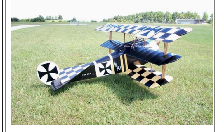
This is a beautiful one-off airplane with plenty of detail.