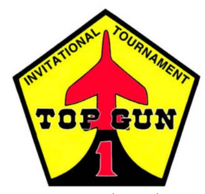
April 23<sup>rd</sup> – 27<sup>th</sup> Lakeland Linder Regional Airport

Our next club meeting is: Thursday May 1<sup>st</sup> at FTE. Plan now to attend.