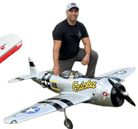
December Benny Paz P-47 ARF