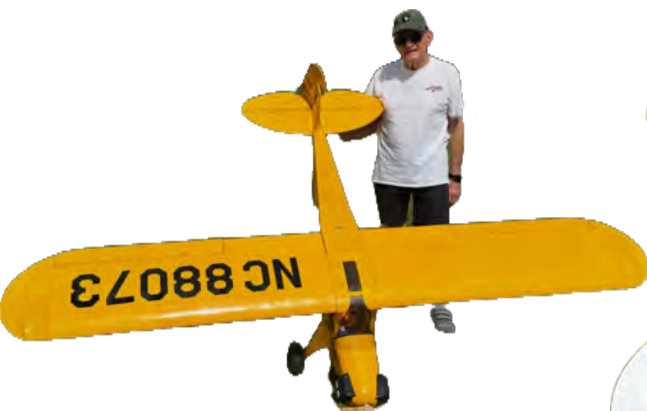
October Wally Sunday Piper Cub ARF