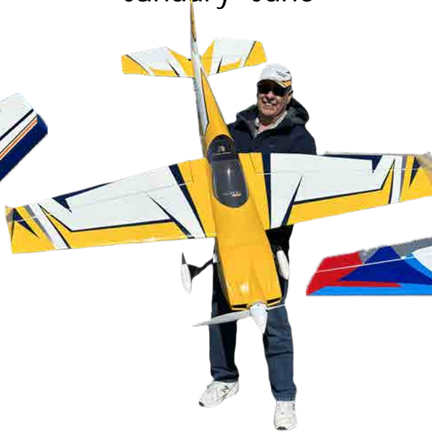
February Will Reding Skywing Laser 260 ARF