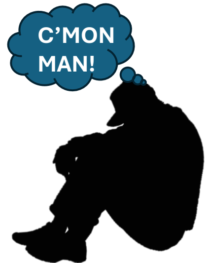
June Nobody Nothing NADA