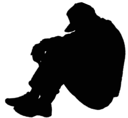
June Nobody Nothing NADA