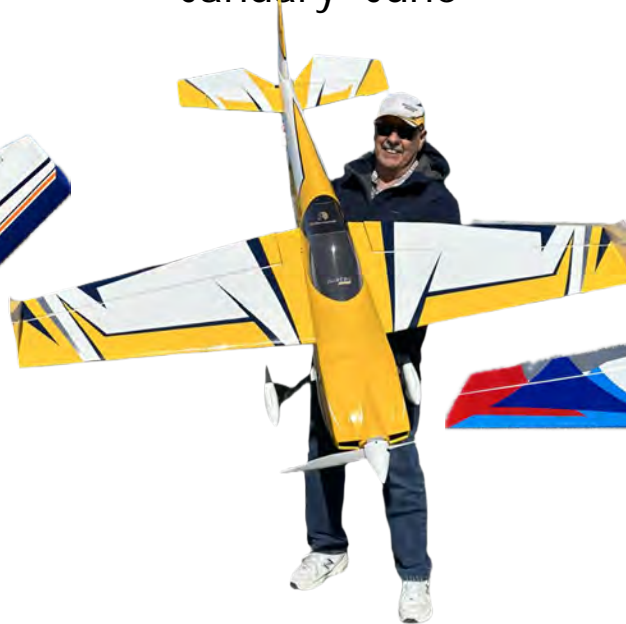
February Will Reding Skywing Laser 260 ARF