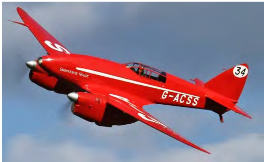
DeHavilland DH88 Comet