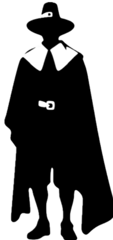
November Could Be You Your Plane Your Build