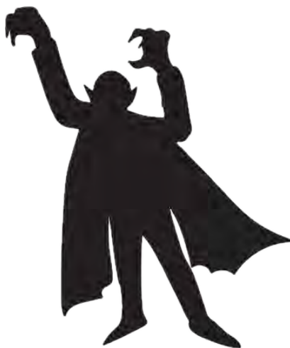
October Could Be You Your Plane Your Build