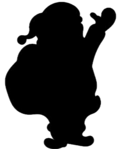
December Could Be You Your Plane Your Build