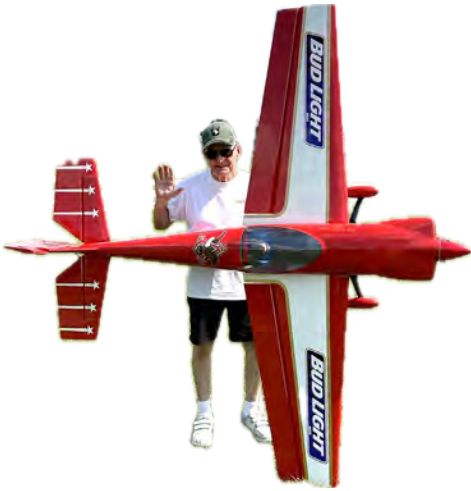
July Wally Sunday Lazer 200 ARF