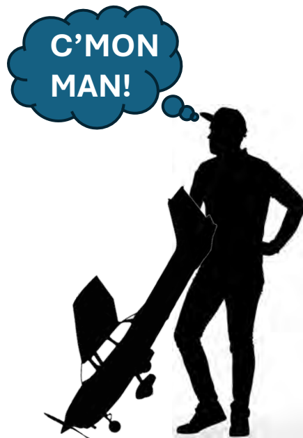
May Mr. Nobody Nothing Not Built