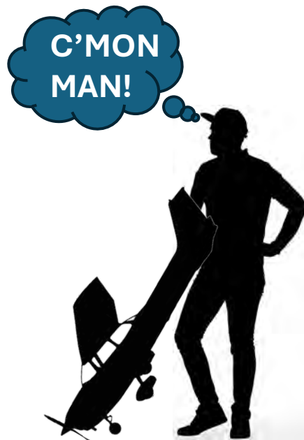
May Mr. Nobody Nothing Not Built