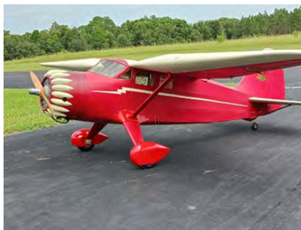
Rebuilt and flown by Jimmy Garland