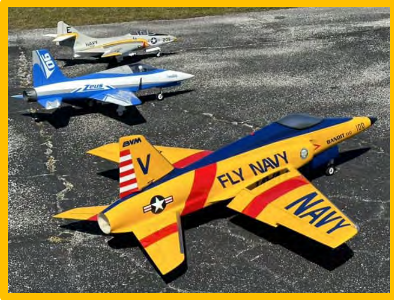
Top to bottom: The Freewing F-9 Cougar 80mm, Freewing Zeus 90mm, and the BVM Bandit 120mm; all Electric Ducted Fan!