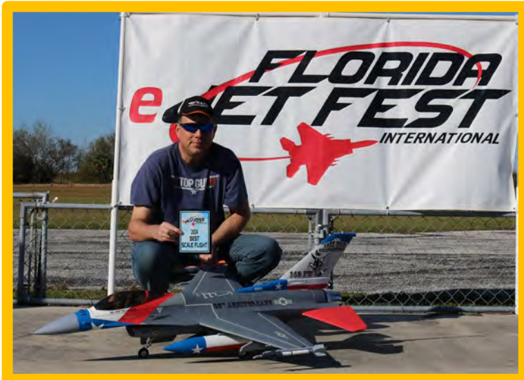
Best Scale Flight 2024 NEED NAME