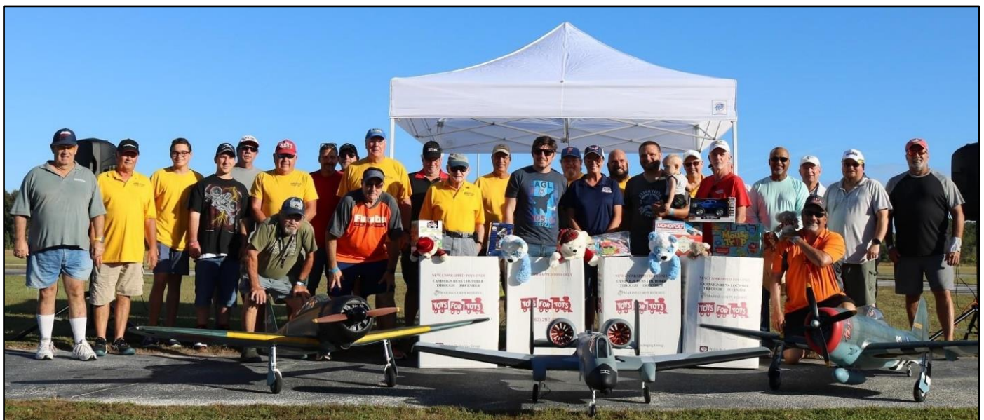
Above is a picture of all pilots and contributors present on Saturday for our Toy's for Tot's toy drive!