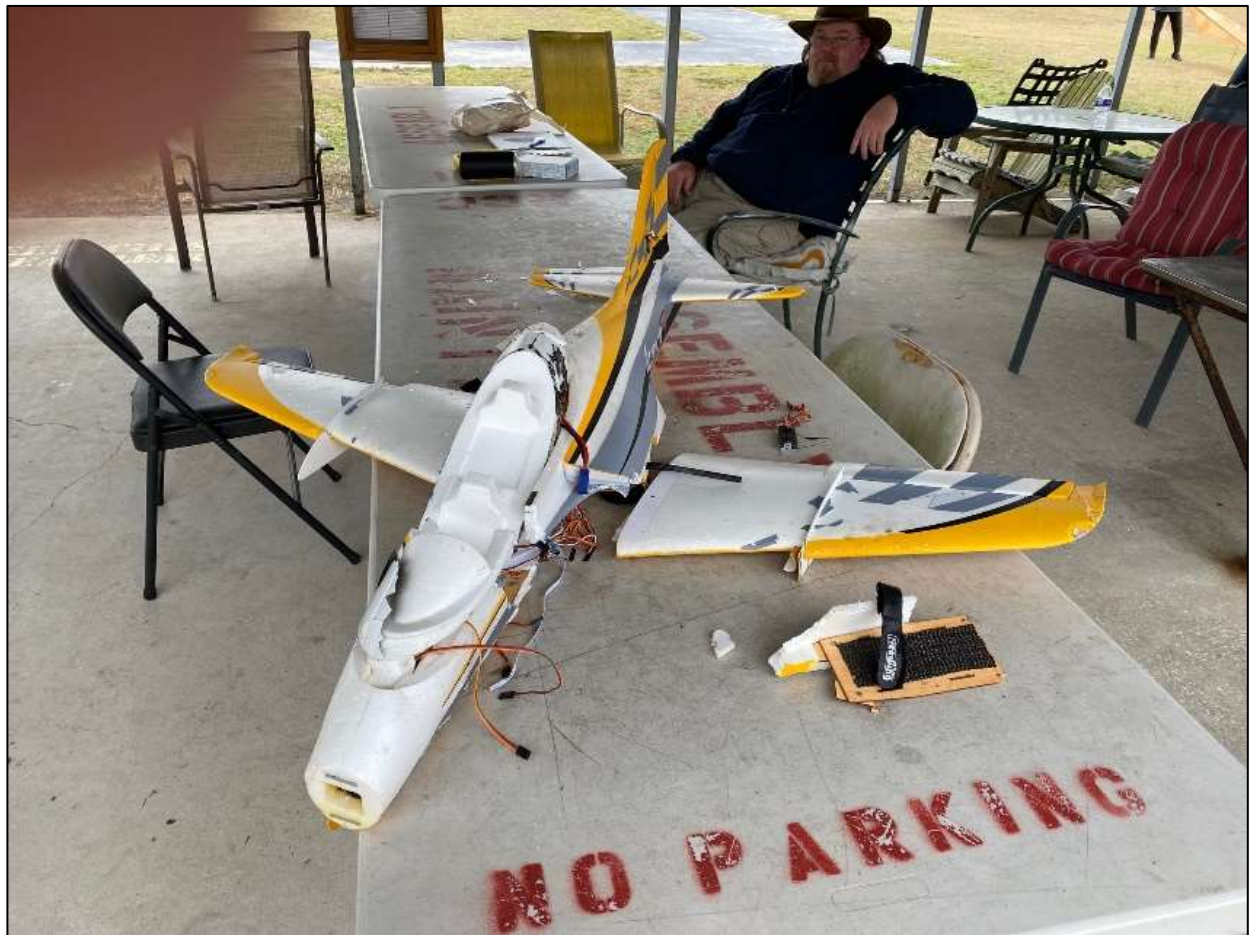
Actual "NTSB" crash reconstruction photo of Tom's Avanti