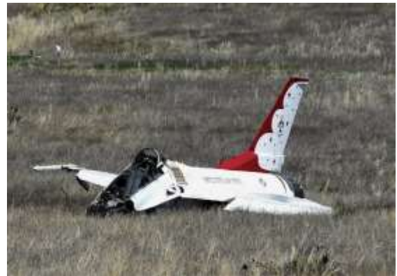
A dramatic recreation of Brian's crash