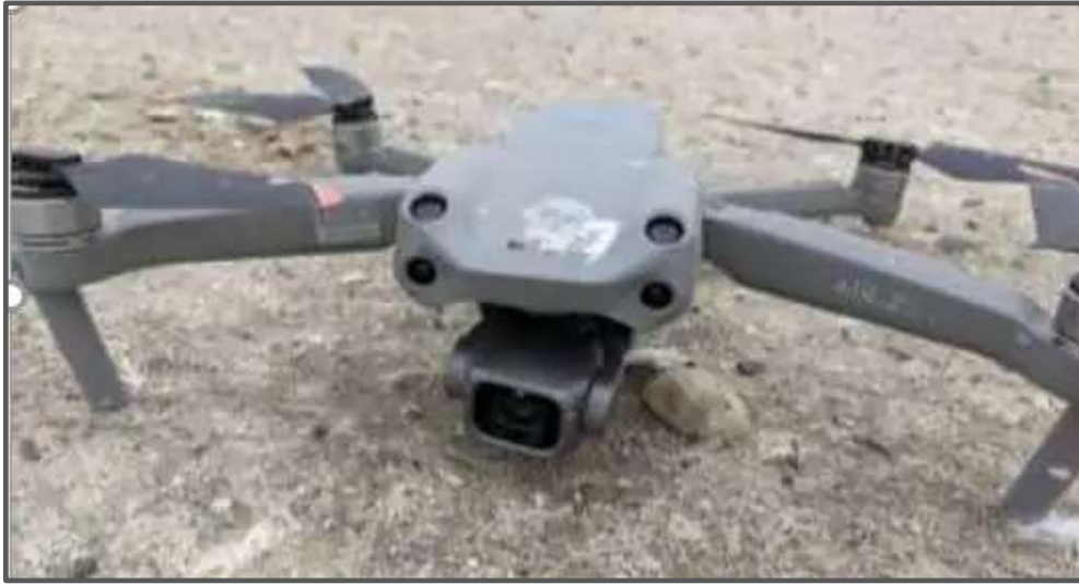
A drone that landed on nesting grounds at the Bolsa Chica Ecological Reserve in May.

There’s also been an increase in dogs roaming off-leash, which Loeb said can scare the birds. Loeb said dogs, horses and bicycles are all prohibited in the reserve because they can damage the wildlife.