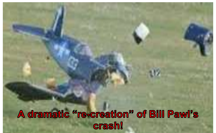
A dramatic "re-creation" of Bill Pawl's crash!