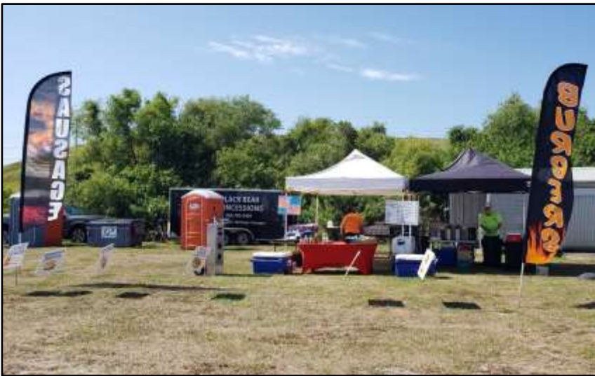
Black Bear Concession was on-site serving up some great food!