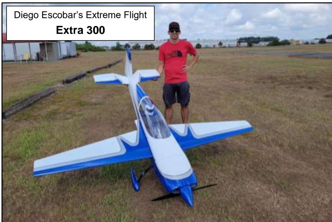
Diego Escobar's Extreme Flight Extra 300