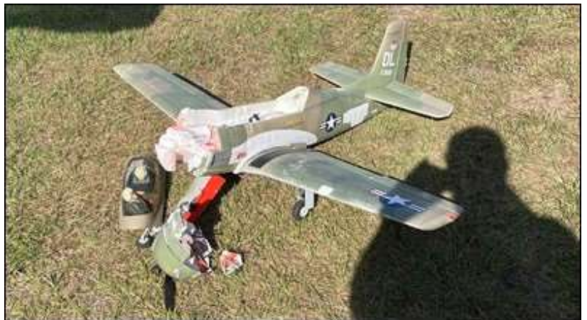
The remnants of Jack's customized T-28 as documented by Jack immediately after the crash.