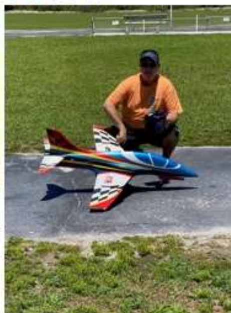
Tommy Nolin's AvantiS 80mm EDF from Motion RC