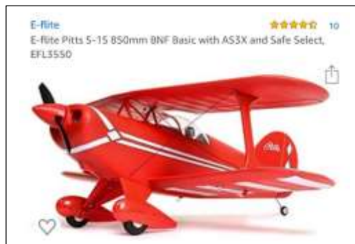
Jay Samples Pitts Premortem