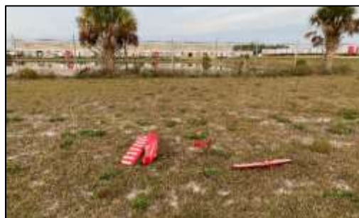
Jay Samples Pitts Postmortem