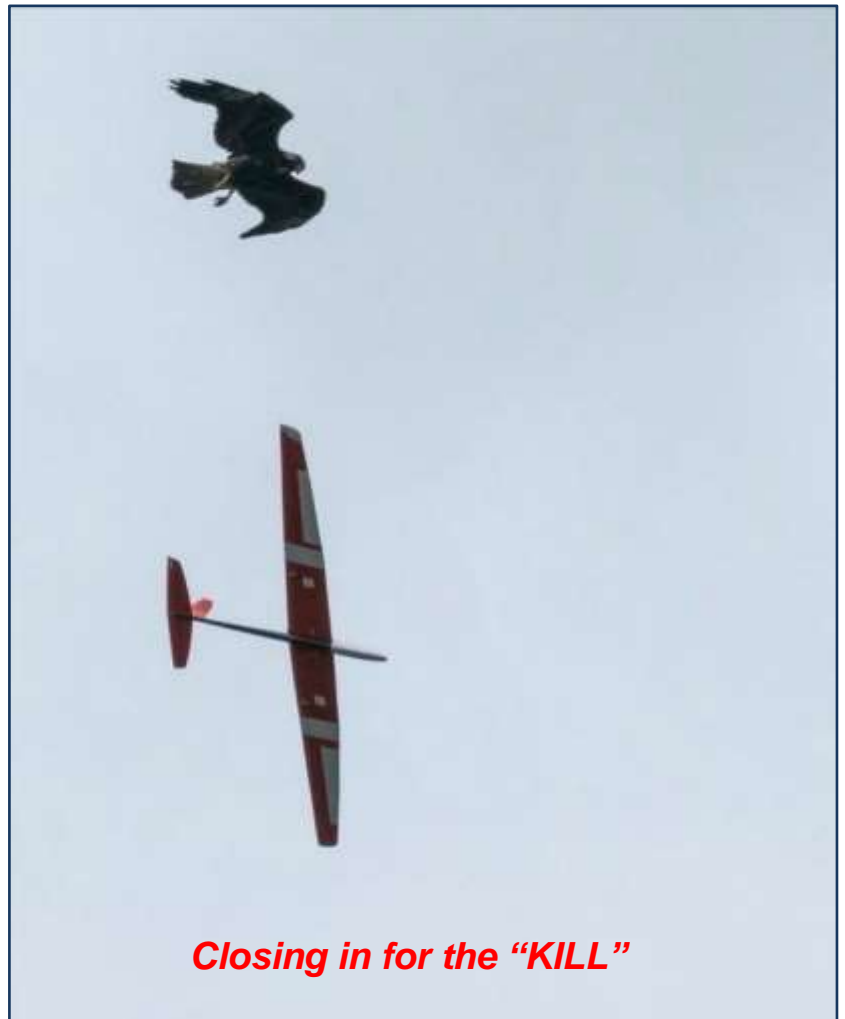
Closing in for the "KILL"