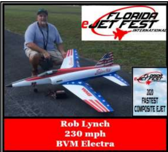
From Deltona Beach, FL