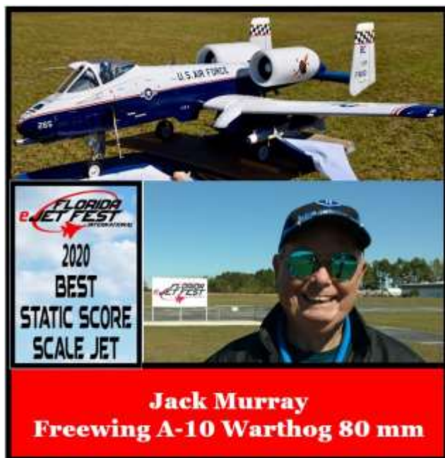
Jack Murray Freewing A-10 Warthog 80 mm