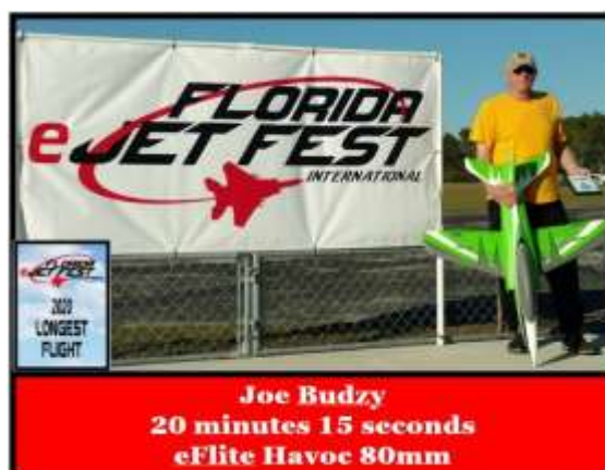
Joe Budzy 20 minutes 15 seconds eFlite Havoc 80mm