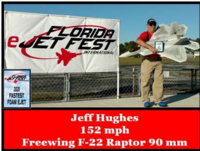
From Lakeland, FL