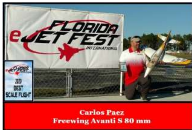
Carlos Paez Freewing Avanti S 80 mm