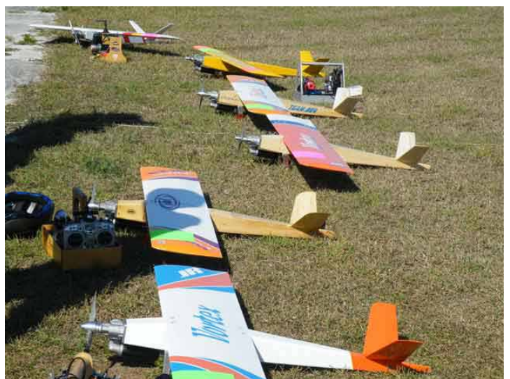
A few Quickies in the staging area ready for battle

OUR NEXT MEETING IS ON SATURDAY, MAY 12TH, 9:00AM AT THE IRCC FLYING FIELD!