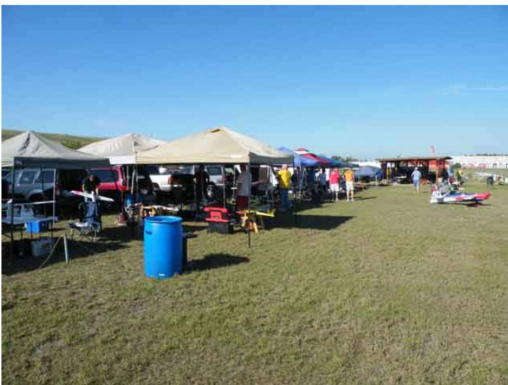
The East side of the flight line – wall-to-wall tents

Thanks to all the members for the tireless work to put on an excellent event and for volunteering your time so we can all play. I have received thank you letters from all over the country from the guys who were here and they all loved the event. We had pilots from Minnesota, Georgia, North & South Carolina, Venezuela, Texas and of course Florida. Thanks again to all the volunteers who made all of this possible.