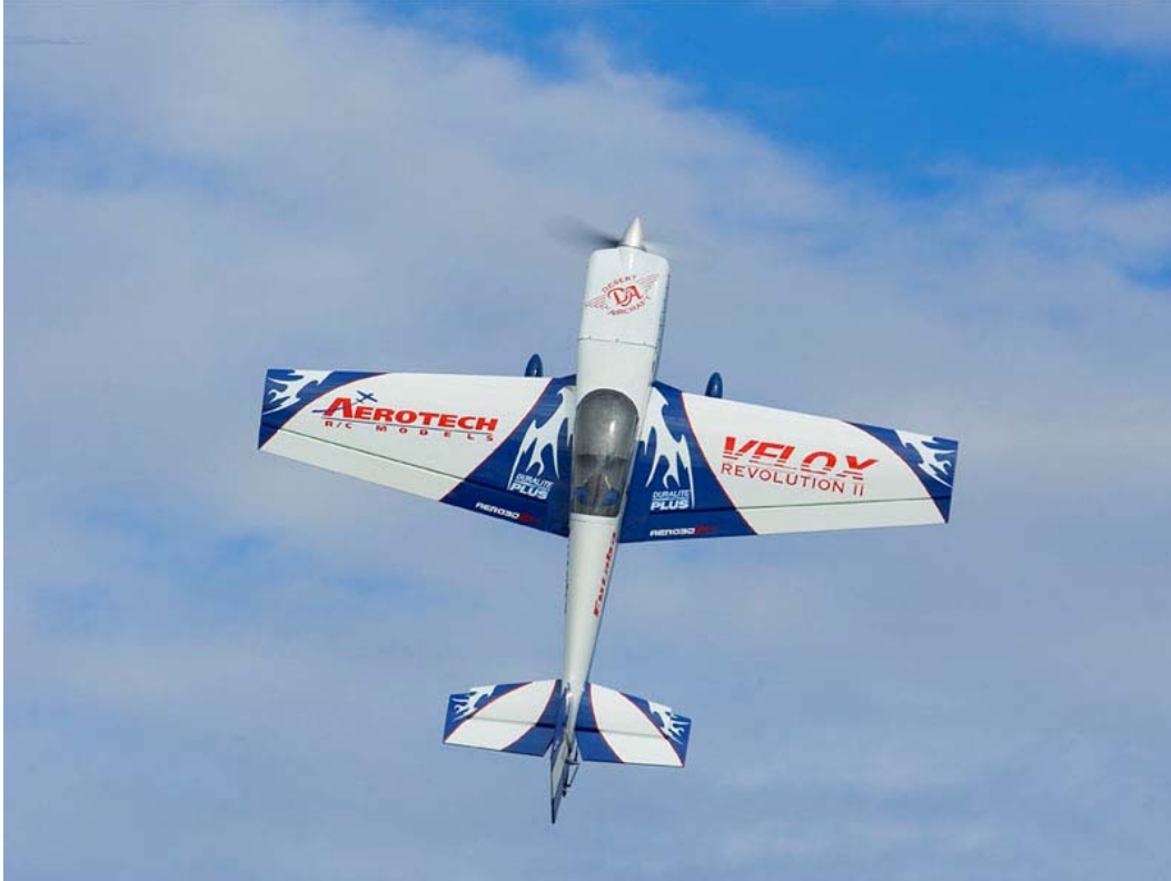
Not sure who this plane belongs to, but it was in the air all day.